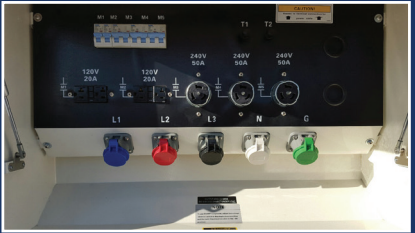
CUSTOMER CONNECTION CAM-LOK STANDARD