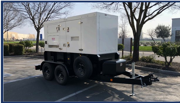
LARGE CAPACITY FUEL CELL

UQ-80: Standby Rating: 81 kVA / 65kW Prime Rating: 73kVA / 59kW