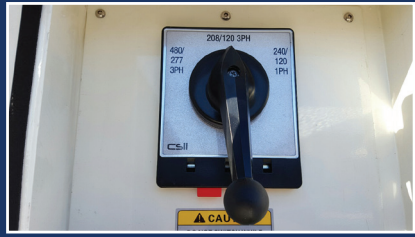
3 POSITION VOLTAGE SELECTOR SWITCH