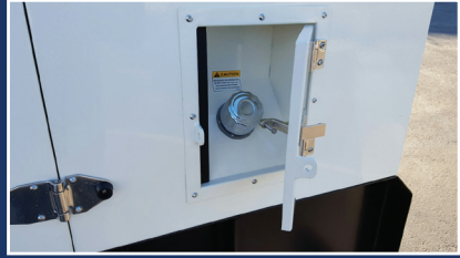
LOCKABLE EXTERNAL FUEL FILL